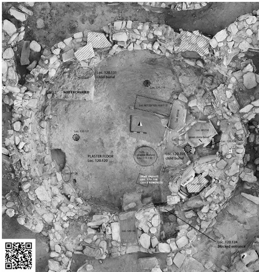
Fig. 2 Shkārat Msaied 2016, Unit F: 3D-model with Locus-numbers. Hatching:= misplaced stones; QR-code link to 3D-model (prepared by M.Kinzel).

later floors, walls and fill-material to expose fully an earlier plaster floor (Loc. 120.120) to identify remaining, additional burials. This was also meant to clarify the stratigraphic context in the building.