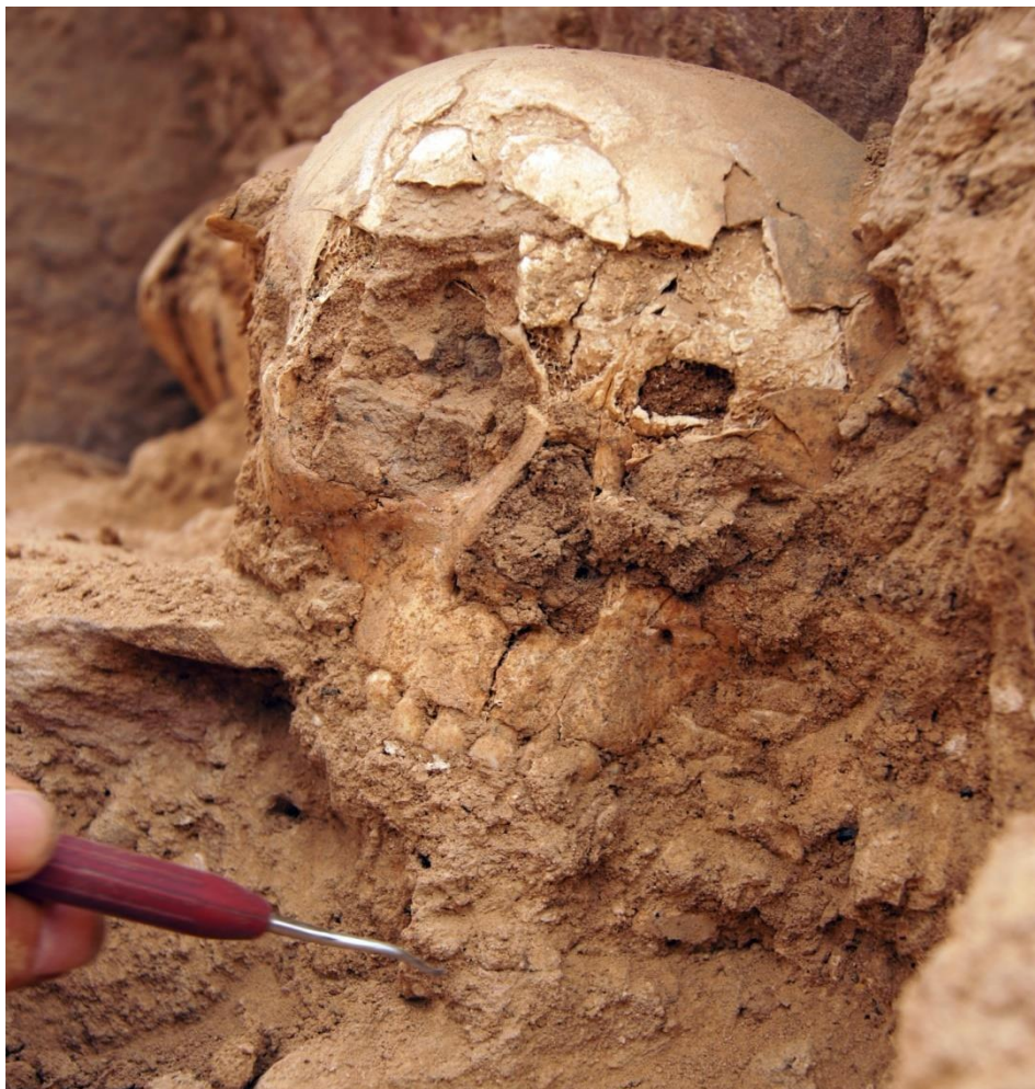
Fig. 3 Shkārat Msaied, Unit F: Skull from skull cache (Loc. 110.108) found in 2015.

remains of an older building (as partly explained above). East of the entrance to Unit F (Loc. 120.134) a stone cist (Loc. 110.108) containing three skulls (Fig.3) was recovered at the bottom of wall Loc. 70.209 (Kinzel et al. 2016). This feature is very similar to skull caches from other Neolithic sites such as) Tell Ramad (Ferembach 1969), Jericho (Kenyon & Holland 1981:77), 'Ain Ghazal (Griffin et al. 1998, or Yiftahel (Slon et al. 2014). But the skulls from Shkārat Msaied do not show any traces of plastering or modifications. The plaster floor (Loc. 90105/110.119) was cut in order to build the stone cist. South of the skull deposit (Loc. 110.108) another stone feature (Loc. 110.109) was discovered which contained the remains of at least two foxes ( Vulpes sp ) and might indicate a very close relationship between human and animal remains. Animal bones (although mostly goats, i.e. Capra aegagrus or Capra ibex ) were often found in close association with human remains, or were deposited along the wall of Unit F.