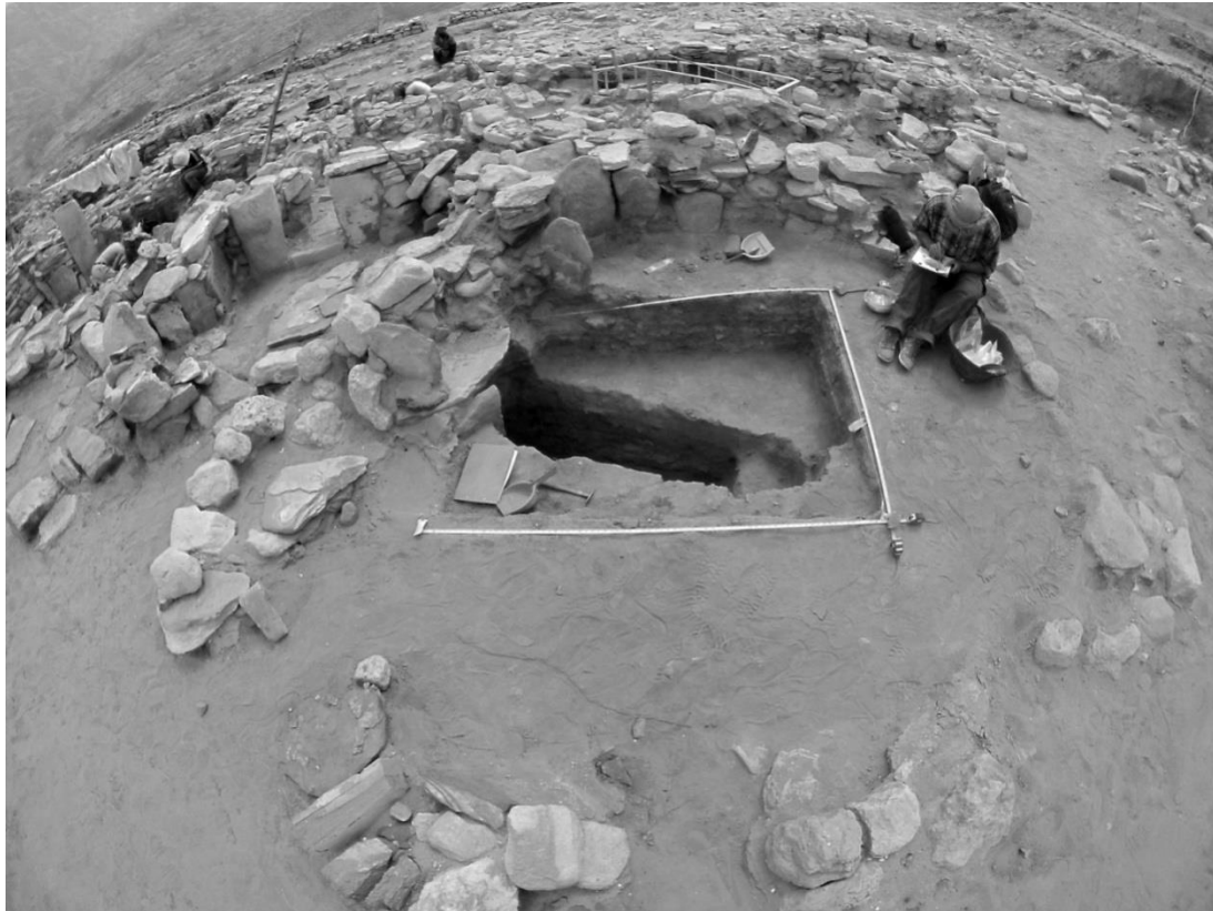
Fig.4 Unit R and the looter's pit under excavation in 2015.

child burials seem to be associated with a later plaster floor (Loc. 90105/110.119) but the burials may still have been contemporary.